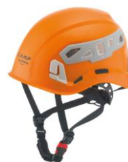
4 - Orange