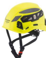
3 - Fluo yellow / Reflective grey