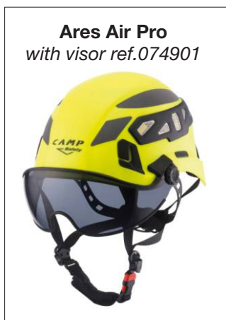
Ares Air Pro with visor ref.074901