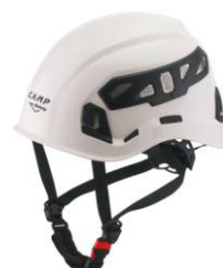
7 - White