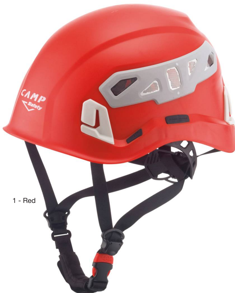
1 - Red